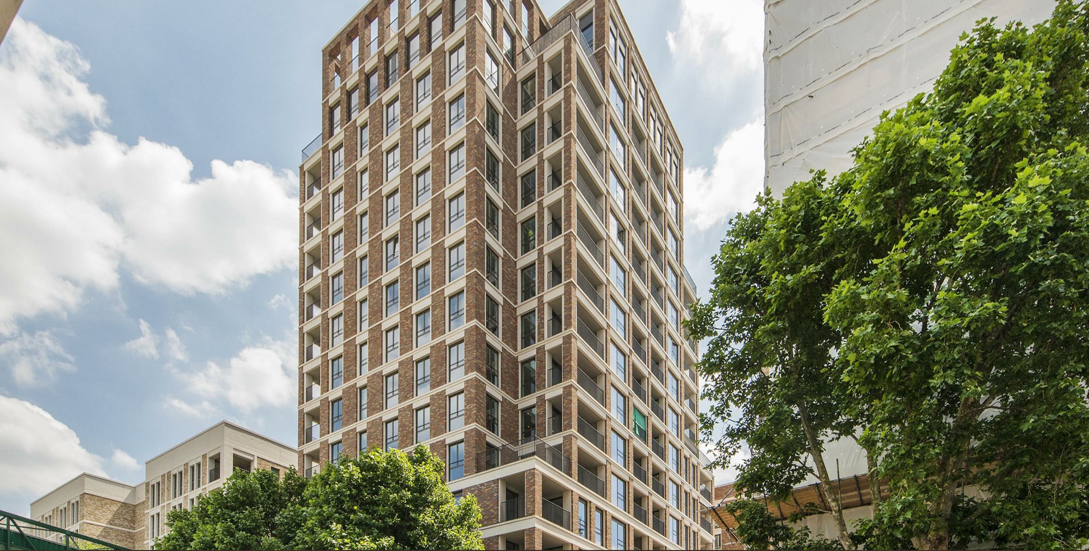
Weymouth House, Elephant Park London SE17